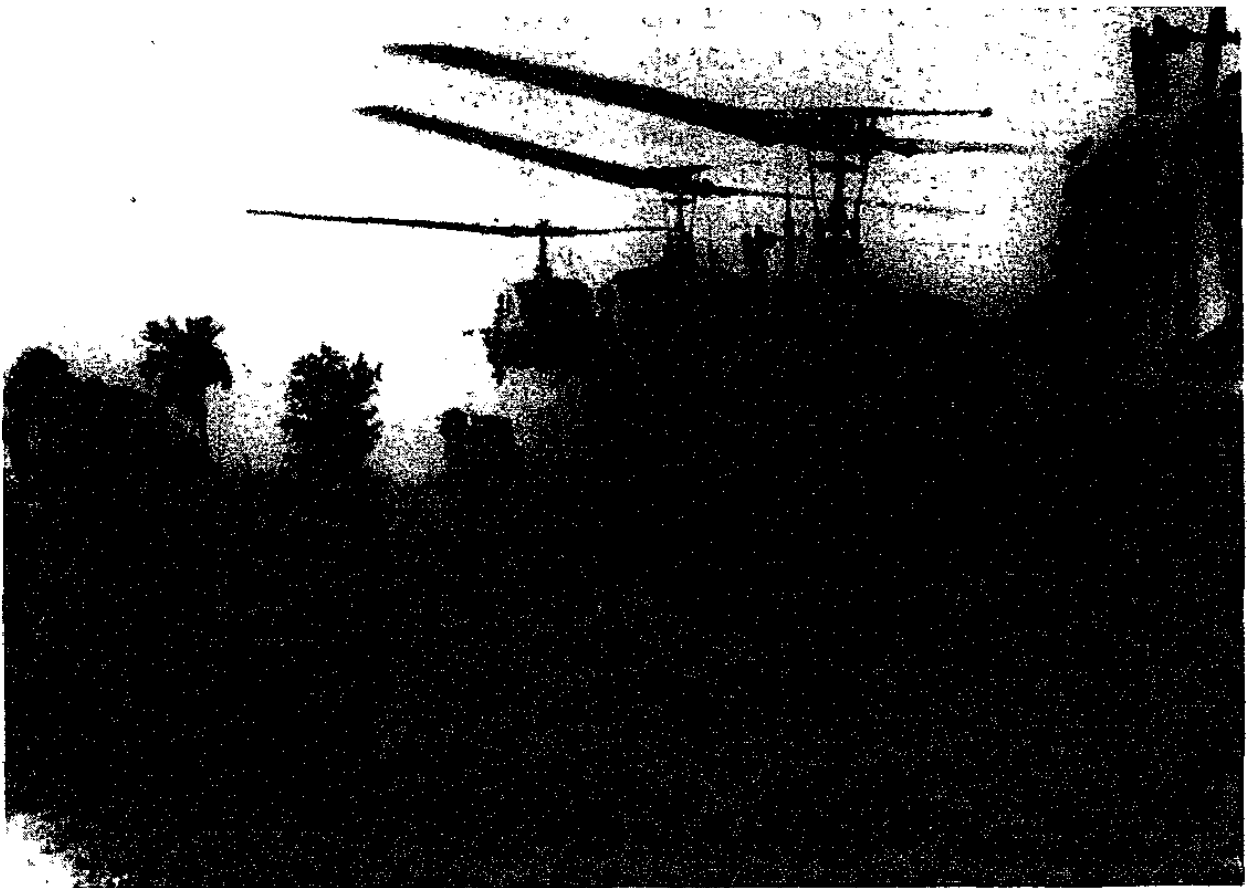
Army News Features