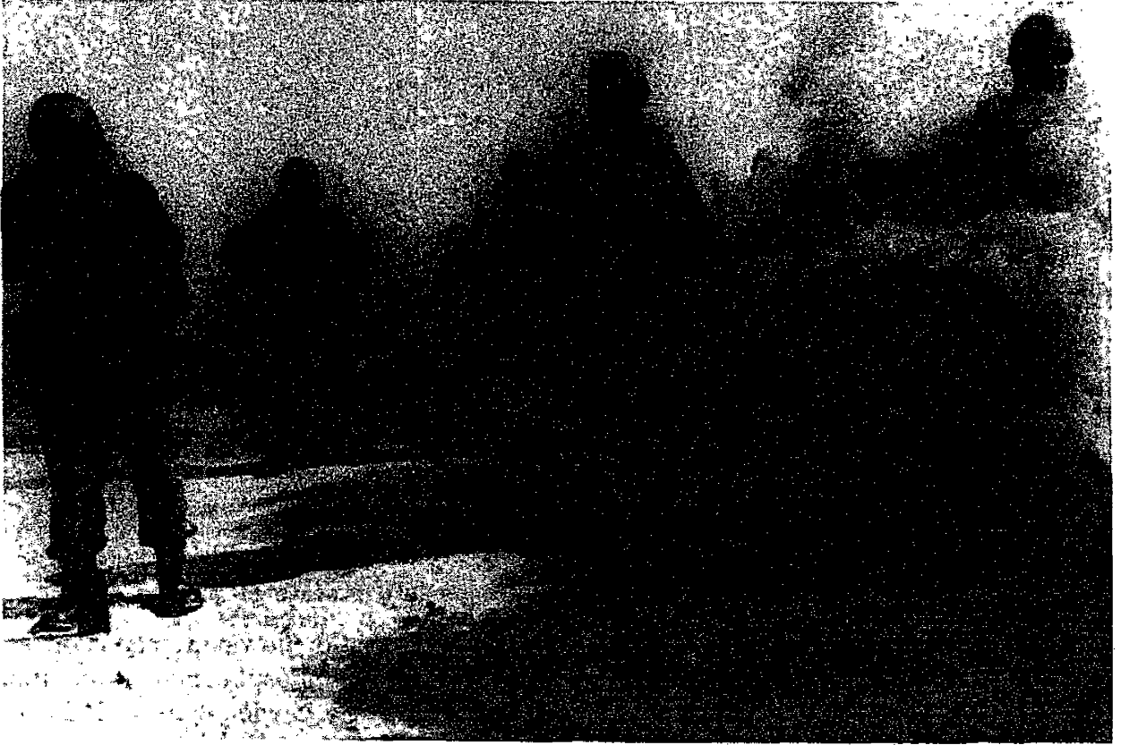
Army News Features

mediate result is a persistent muscular contraction, a state of cramp, followed by paralysis. And this is exactly what happens when the critical esterase, called acetylcholinesterase, becomes inhibited by a G-type phosphorous compound. When the block